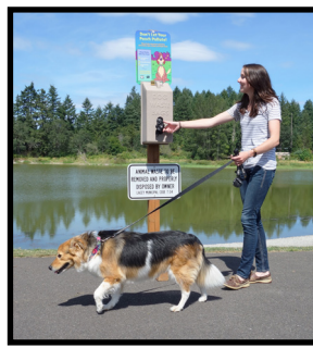
"Bag it and trash it" is the only safe way to dispose of your dog's waste.

Stream Team makes it easy to dispose of your dog's waste with two free giveaways: On-leash, pet-waste bag dispensers and Neighborhood pet waste pick-up stations.