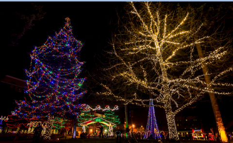
Huntamer Park Holiday Lights!

Monday, December 6, 6:30 p.m. Huntamer Park