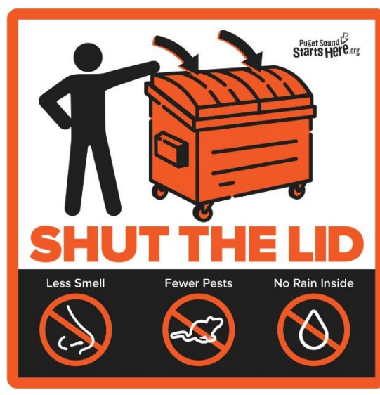
Figure 1. Sample outreach material for dumpster campaign

Businesses selected from our source control inventory in Lacey, totaling 168 commercial establishments, received educational materials along with an introductory letter for the dumpster outreach campaign.