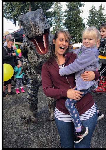
Lacey Spring Fun Fair is a popular community celebration for "kids" of all ages! Don't miss it!

Following a two-year hiatus due to the pandemic, Lacey Spring Fun Fair (Fun Fair) is back and we are excited! Since 1988, Fun Fair has provided thousands of people a weekend of FREE activities and entertainment including rides, games, live music and performances, community booths, a car show (Sunday), and more! Attendees can also purchase food, arts and crafts, and other merchandise from on-site vendors.