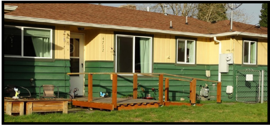
In addition to the City's support, Homes First received a $200,000 grant from the Washington State Department of Commerce Local and Community Projects for the Genesis House Project.

The City of Lacey (City) supports and helps create programs that assist community members, in various stages of their lives, in finding and maintaining affordable places to live. As part of its affordable-housing programs, the City contributed $150,000 to support the purchase of a house for the Genesis House Project , in partnership with Homes First .