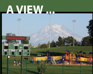
A VIEW ...

Lacey's park system is one of the best municipal park systems in Washington with nearly 1,200 acres of park land and open space, miles of paved, ADA-accessible trails, several community buildings, and the Regional Athletic Complex (RAC).