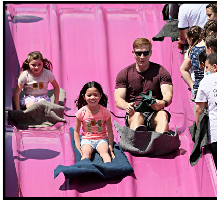
Lacey Spring Fun Fair is a popular community celebration for "kids" of all ages! Don't miss it!

Since 1988, Lacey Spring Fun Fair has provided thousands of people a weekend of FREE activities and entertainment including rides, games, live music and performances, community booths, a car show (Sunday), and more! Attendees can also purchase food, arts and crafts, and other merchandise from on-site vendors.