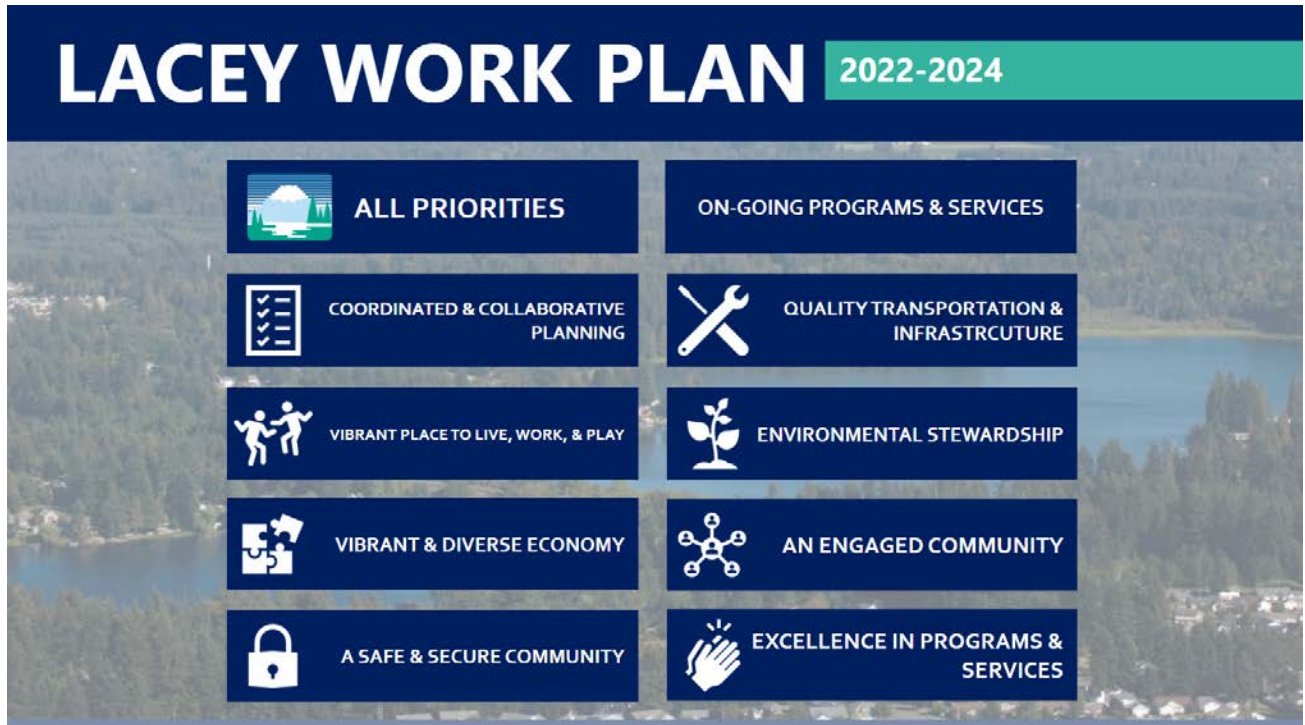
Figure 2: Work Plan 2022-2024 Dashboard Example Search for 2022 and Greg Cuoio Park.