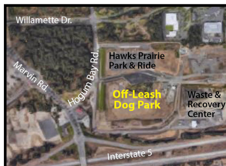
Thurston County Off-Leash Dog Park 2420 Hogum Bay Road N.E., Lacey