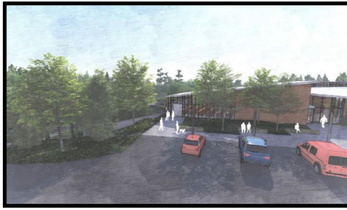
The City is finalizing the purchase of a parcel of land adjacent to City Hall campus from Saint Martin's Abbey for the new Police Station.

The City continues making progress on the project to construct a new Police Station that will also include a Community Room and Emergency Operation Center. The new facility is anticipated to be approximately 40,000 square feet and is designed to grow with and vastly improve the Police Department's ability to provide services to our growing community for the next 30-40 years.