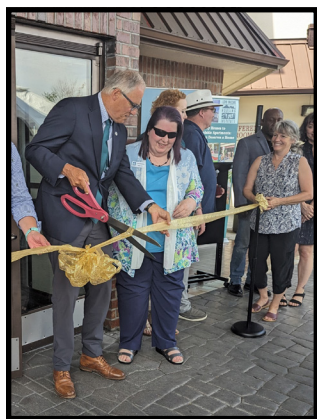
A number of elected officials, including Governor Jay Inslee, and other guests attended the Maple Court ribbon-cutting ceremony on July 5.

During a July 5 ribbon-cutting ceremony, the Maple Court enhanced shelter officially opened to house people living on state property along rights-of-way. Funding for the purchase of the former hotel in Lacey comes from the state Department of Commerce Rights-of-Way program initiated by Governor Inslee and supported by the state legislature.