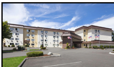
The former hotel has been converted to an enhanced shelter to serve up to 125 people experiencing homelessness in Thurston County.

Residents must agree to a Code of Conduct as a condition of staying at the site.