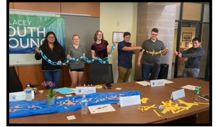
The Lacey Youth Council started off the year with team-building exercises during their orientation.