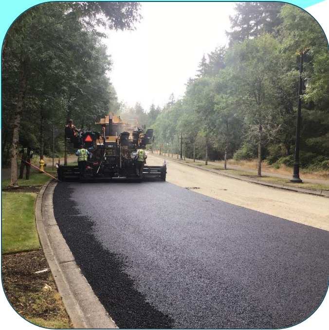
Figure 2 Campus Highlands Dr NE