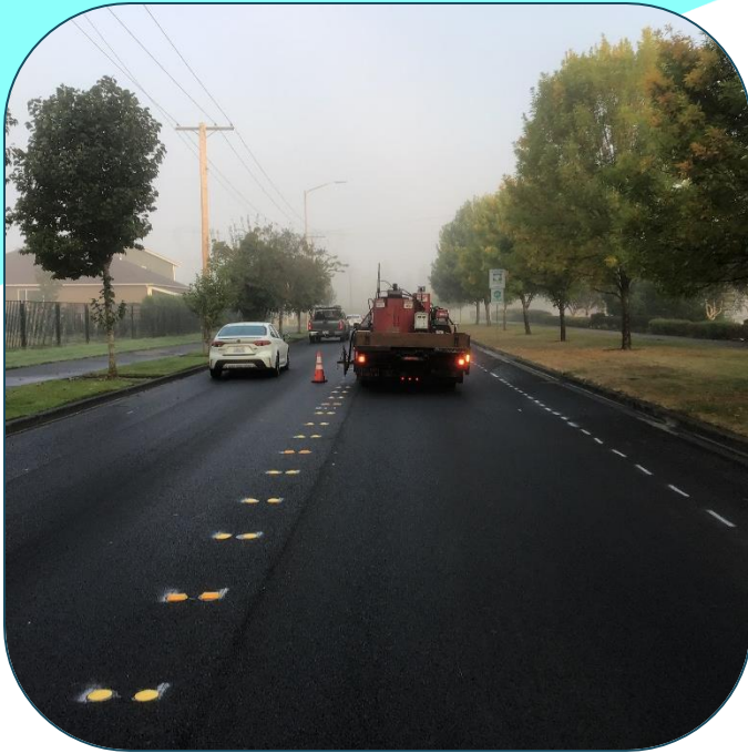
Fig. 6 Rainier Rd SE