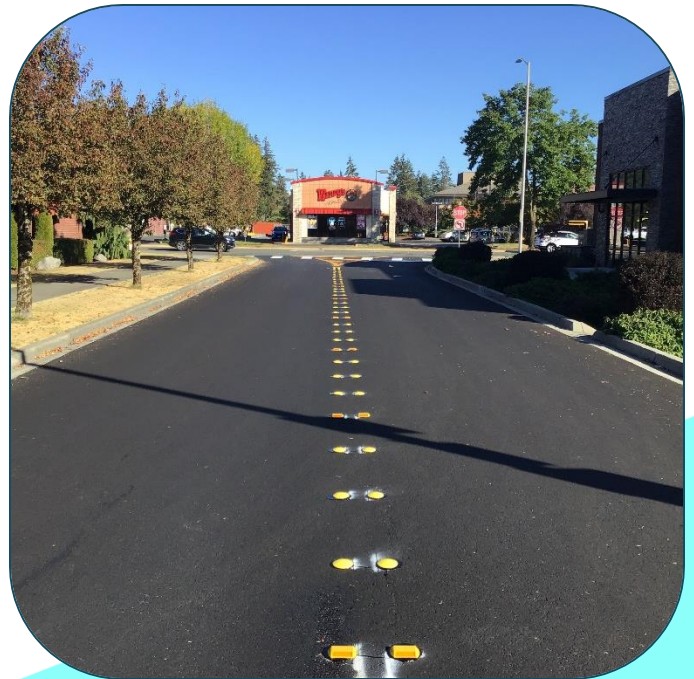
Figure 5 Royal St SE