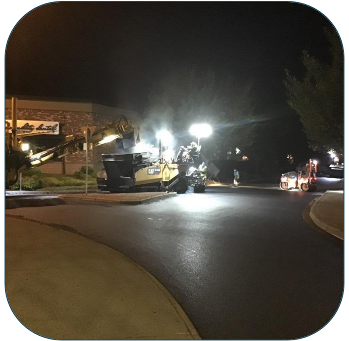
Figure 3 Galaxy/Quinault RAB