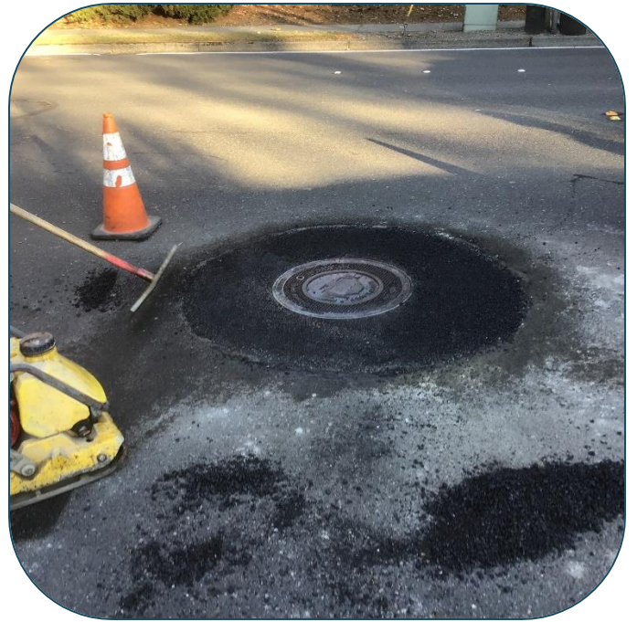
Fig. 11 Manhole Repair