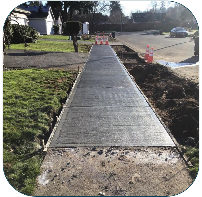
Fig. 7 Sidewalk @ Avonlea