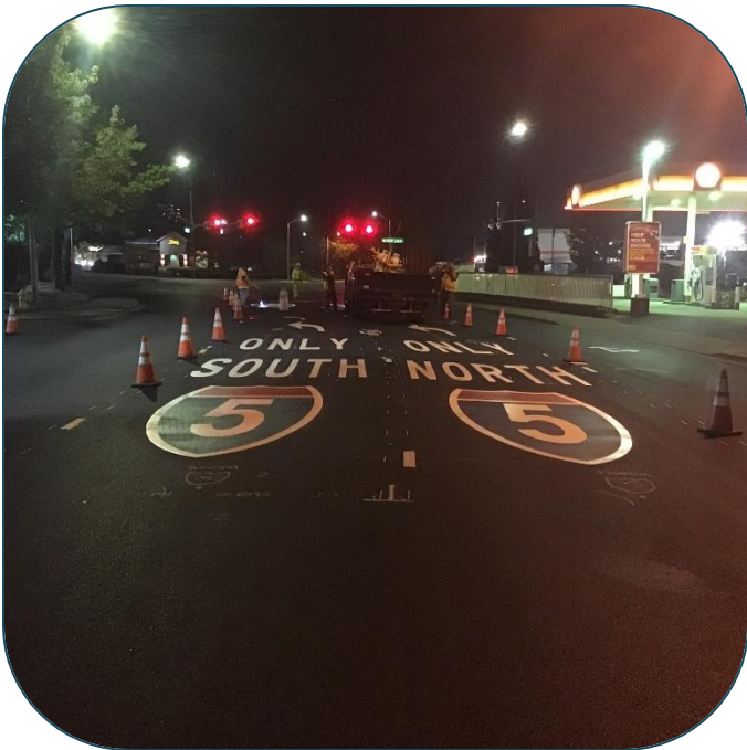
Figure 4 Quinault Dr NE