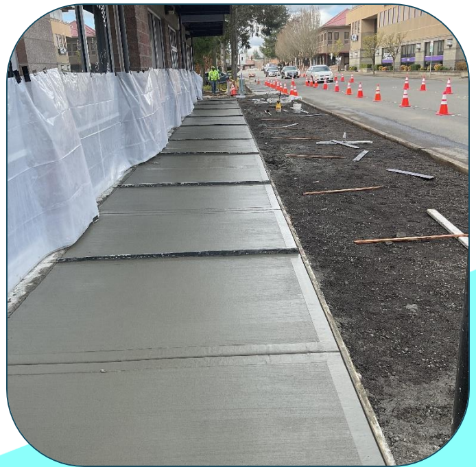
Figure 9 Sidewalk @ 6th Ave