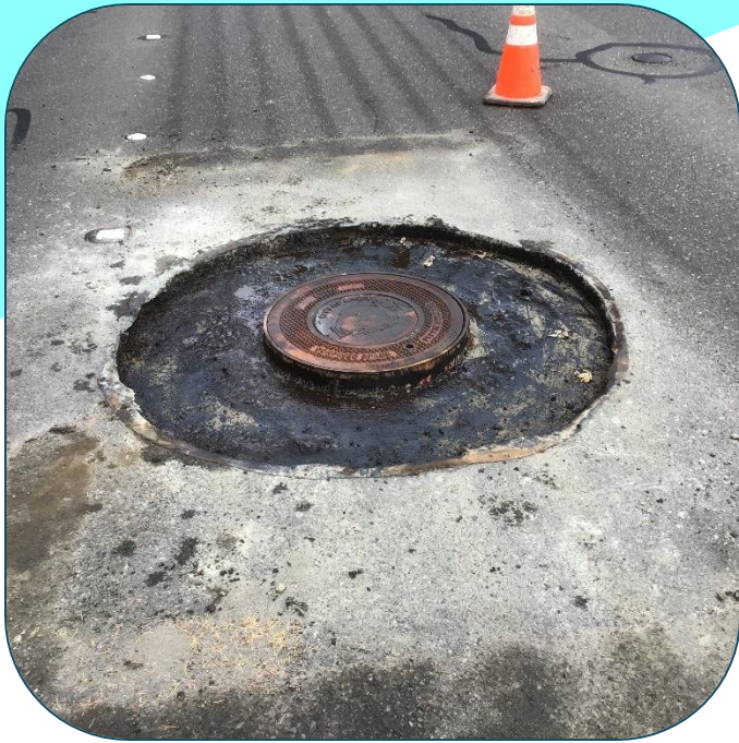
Fig. 10 Manhole Repair