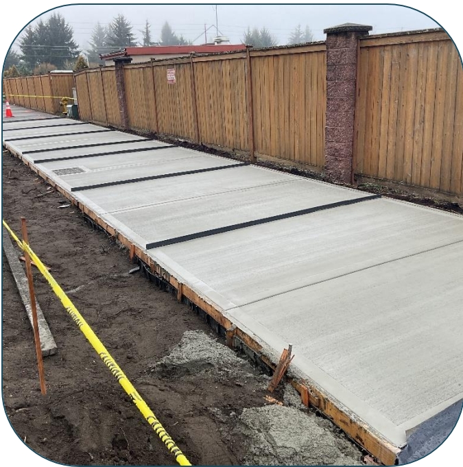
Figure 8 Sidewalk @ Parkside