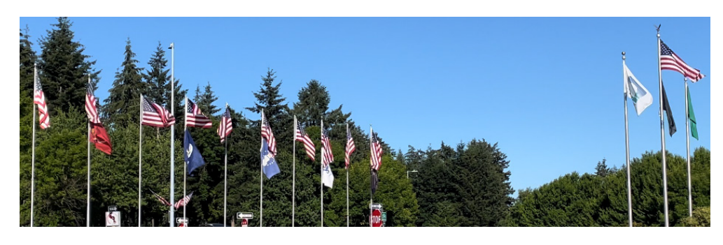
Adopted by the Lacey City Council on December 7, 2023