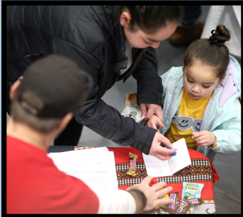
Free Hands-on Activities

For more details, visit LaceyParks.org/Cultural-Celebration or scan: