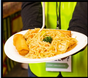
Tasty Treats for Purchase