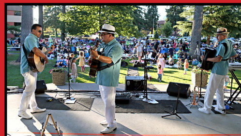
Concerts in Huntamer Park are always a hit!

If music, movies, entertainment, and events are more your style — we have that too! All summer long, you'll find a variety of free entertainment options with something for everyone! Check out the full schedule at CityofLacey.org/Events and let the summer fun begin!