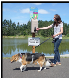
"Bag it and trash it" is the only safe way to dispose of your dog's waste.

Stream Team makes it easy to dispose of your dog's waste with two free giveaways : On-leash, pet waste bag dispensers and neighborhood pet waste pick-up stations.