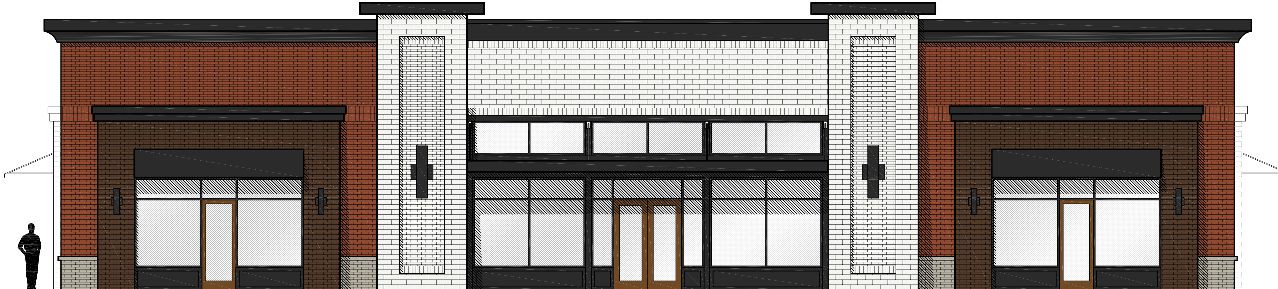
B WEST ELEVATION - BUILDING 1 SCALE: 3/16"=1'-0"