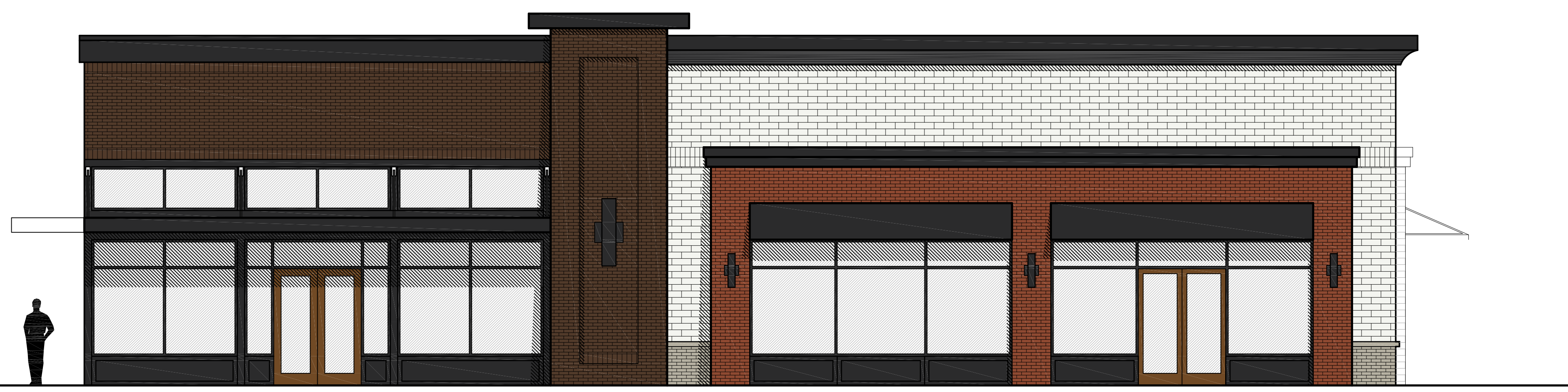
B NORTH ELEVATION - BUILDING 3 SCALE: 3/16"=1'-0"