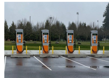
The new DC FAST chargers reduce your vehicle charge time to an hour or less!

EV chargers will also be added at the Lacey Timberland Library and Lacey Community Center. Watch for more information coming soon.