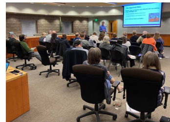
The Lacey Community Academy offers classroom style learning and hands-on experiences.