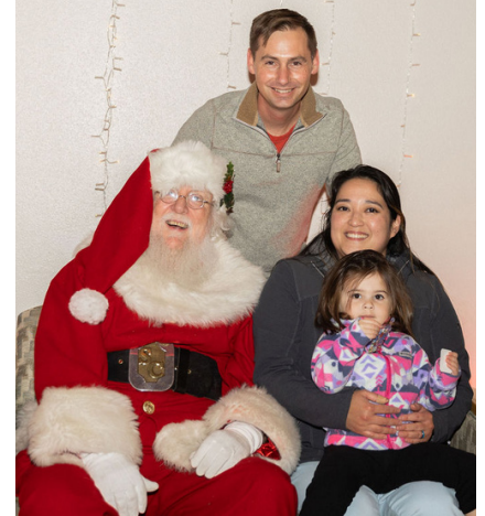
Get your holiday spirit started at the Lacey Holiday Market!

Visit the Upcoming Events link to the left to get more details. We hope to see you there!