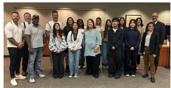
The Lacey Youth Council kicked off the year with an orientation and a meet-and-greet with the City Council.