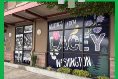
The new Lacey Museum will open in its new location in mid January: 4160 6th Ave SE, Suite 101, Lacey, inside the Bell Towne Centre.